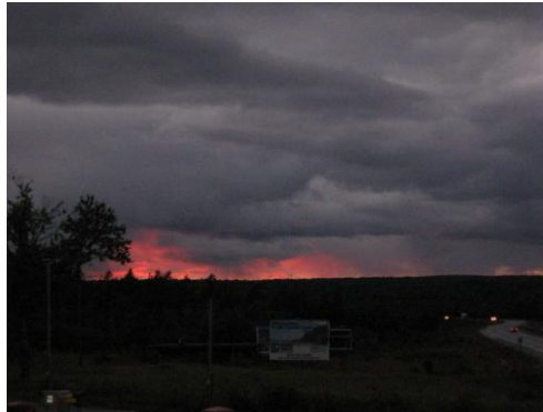
Actual sunset view from units!

Waterstone Suites 17579 Menge Creek Road L'Anse, MI 49946 Phone: 906-524-2323 Toll free: 1-888-896-0825 Fax: 906-524-2324 www.thewaterstonesuites.com